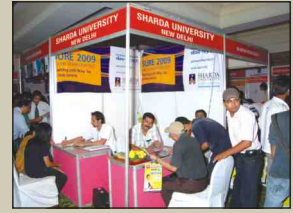
Sharda University - NCR Delhi