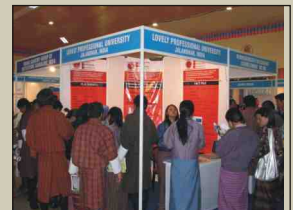
Lovely Professional University - Jalandhar