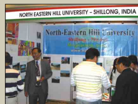
North Eastern Hill University - Shillong