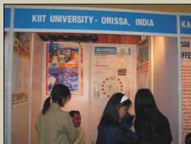
KIIT University - Orissa