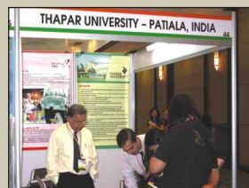
Thapar University - Patiala