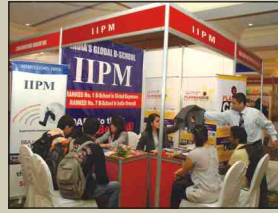
IIPM - New Delhi