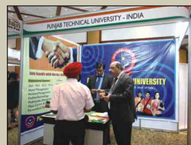
Punjab Technical University