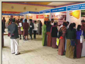
Students exploring various career options