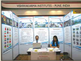
Vishwakarma Institutes - Pune