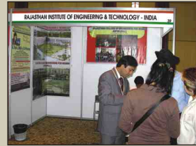
Rajasthan Institute of Engg. & Technology