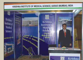
Krishna Inst. of Medical Science, Mumbai