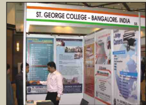
St. George College - Bangalore