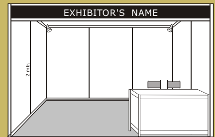
A typical 3m x 2m stall