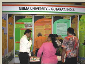
Nirma University - Gujarat