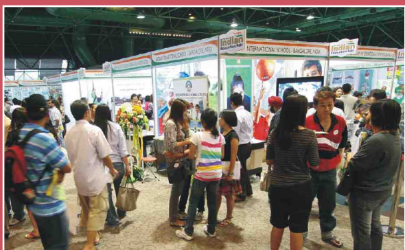
Visitors at the past Education Fair at Bangkok in 2009

The Great Indian Education Fair is supported by various Government & Trade Bodies