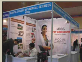
Manipal College of Medical Science