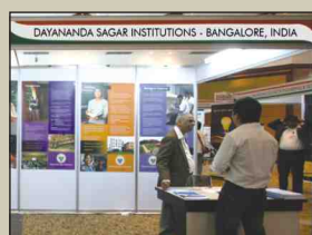
Dayananda Sagar Institutions - Bangalore