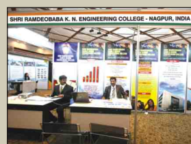
Shri Ramdeo Baba K. N. Engg. College