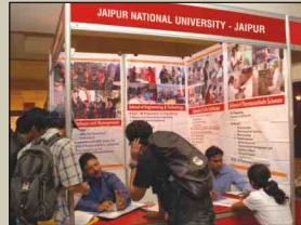
Jaipur National University - Jaipur