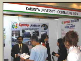
Karunya University - Coimbatore