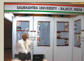
Saurashtra University - Rajkot