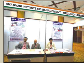
Siva Sivani Inst. of Mgmt. - Secundrabad