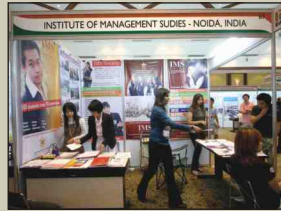
Institute of Management Studies - Noida