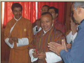
H. E. Lyonpo Thakur S. Powdyel, Education Minister of Bhutan Inaugurating the event