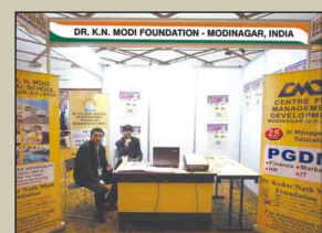
Dr. K. N. Modi Foundation - Modinagar