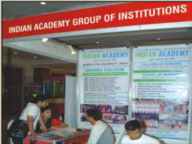
Indian Academy Group of Inst. - Bangalore