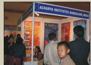
Acharya Institutes, Bangalore