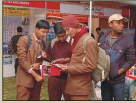
Students exploring various career options