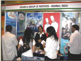
Atharva Group of Institute