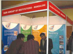
SGR Institutions - Bangalore