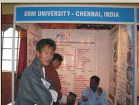
SRM University - Chennai