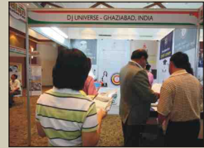
DJ Universe - Ghaziabad