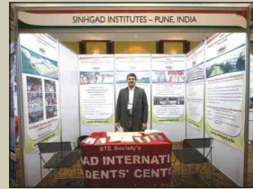
Sinhgad Institutes - Pune