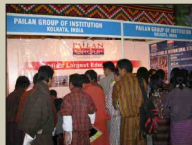
Pailan Group of Institution, Kolkata