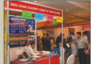
Indo Asian Academy - Bangalore