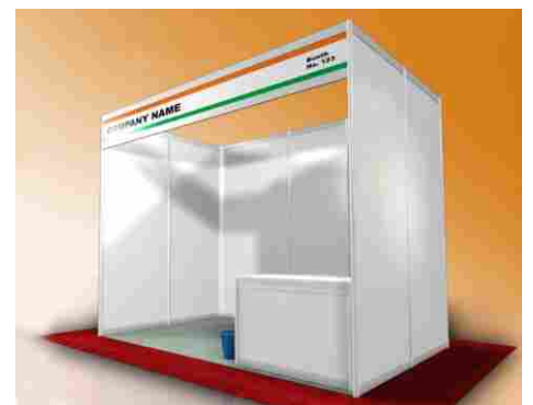
A typical 2m x 2m stall