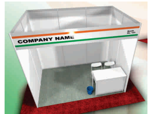
A typical 3m x 2m stall